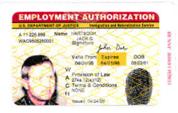
Form I-688B (May 1995)

In May 1995, some INS offices began issuing a modified I-688B. The most significant change was to the card stock which was changed from a Polaroid process to a synthetic material called Teslin on which the biometric and biographic data of the bearer was printed. Note that, on this version, the bearer's name is printed on two lines.