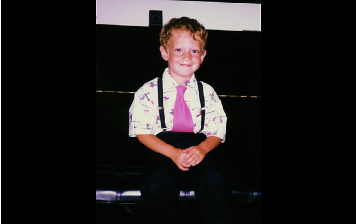
Facebook Founder Mark Zuckerberg circa 1990.

The World Has Changed Since 1990, U.S. Immigration Policy Has Not