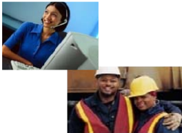
Top 30 U.S. States & Territories, by Total Workers Certified

“INNOVATION DISTINGUISHES BETWEEN A LEADER AND A FOLLOWER” - STEVE JOBS